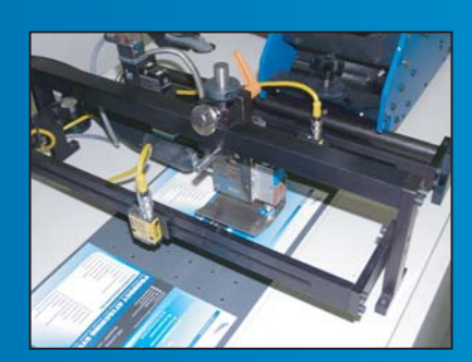
Lorem ipsum dolor sit amet, consectetur adipisicing elit, sed do eiusmod tempor incididunt ut labore et dolore magna aliqua.